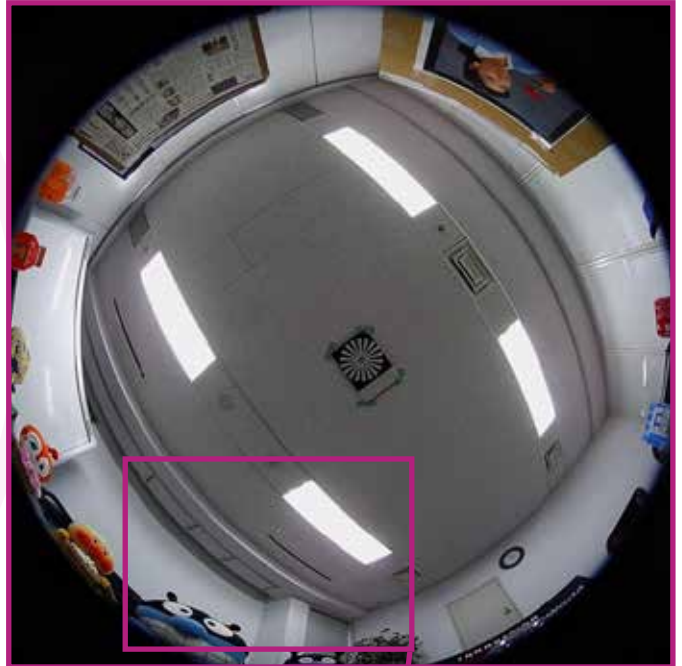
General equidistant lens